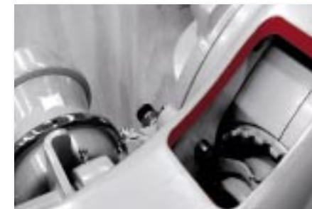
Driver control differential lock available for both axles.