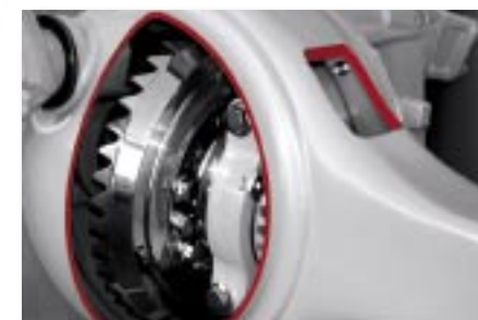
Cut-out showing precision ground gear set.