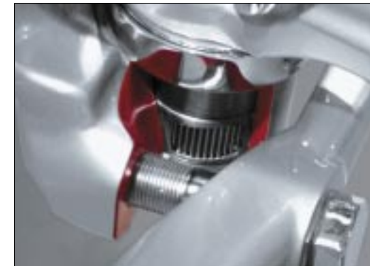
Needle bearings replace bushings for greater reliability. Bolted steering and tie rod arms enable quick and easy exchange.