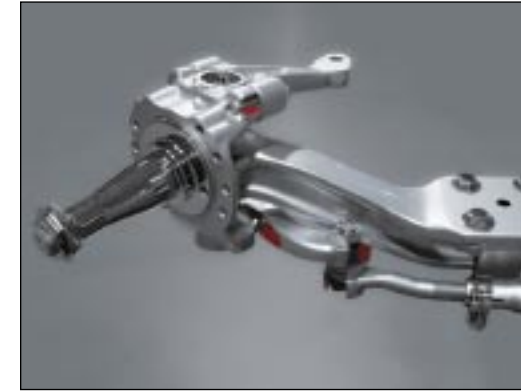
Steering and tie rod arms designed for maximum 55-degree wheel cut for added maneuverability.