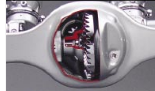
Proprietary precision machining provides quiet operation and higher performance.